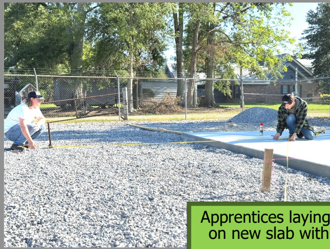
Apprentices laying out small hydraulic course on new slab with Instructor Leon Lemoine.