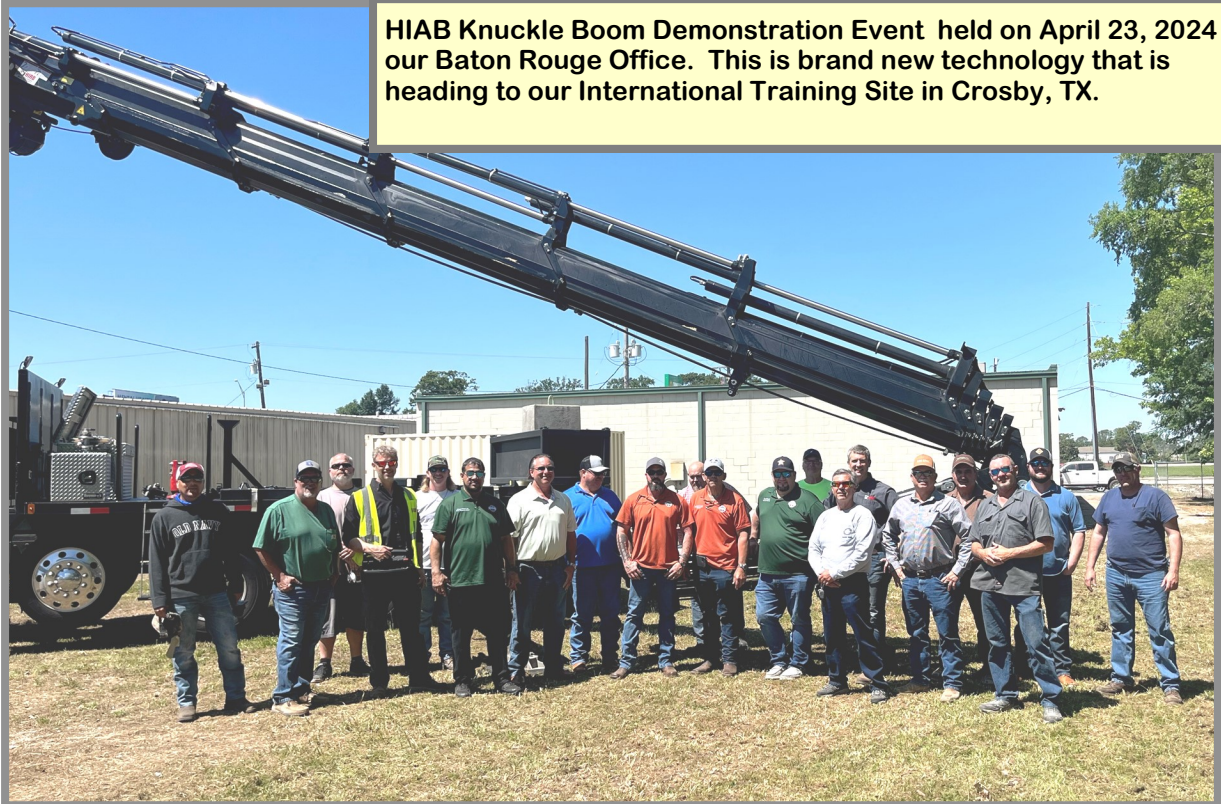
HIAB Knuckle Boom Demonstration Event held on April 23, 2024 at our Baton Rouge Office. This is brand new technology that is heading to our International Training Site in Crosby, TX.

Enjoy the summer and make memories that will last a lifetime in the hearts of your loved ones. I hope to see you all at your next district meeting, if not, I'll see you on the job somewhere.