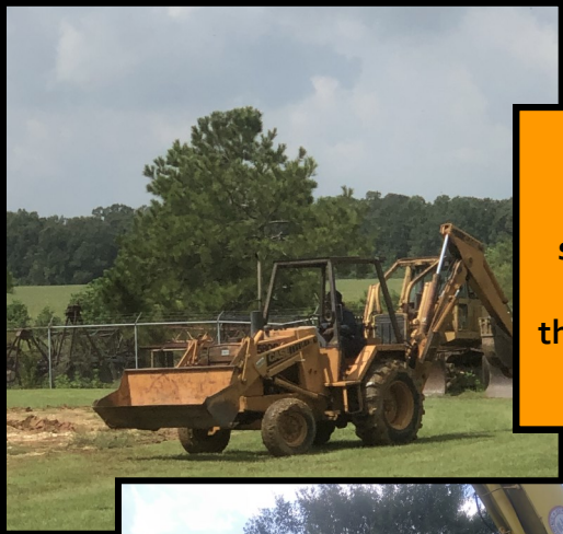
Troydell Pugh spreading gravel at the site with backhoe.