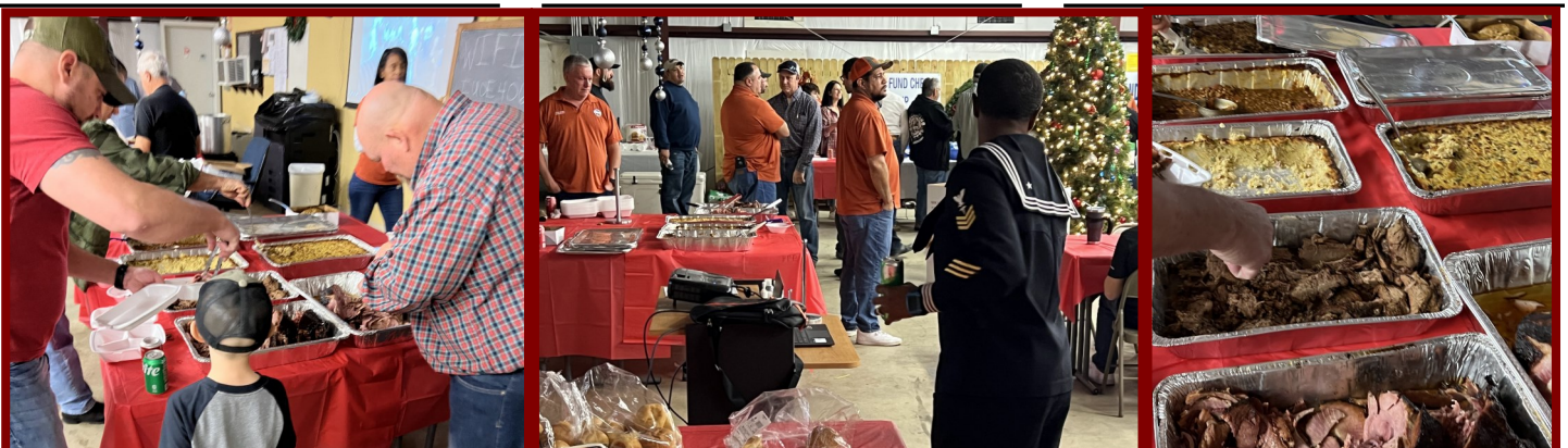
Christmas Party at the Training Facility

missing a great opportunity and the potential to make great strides in improving your skill set. Members that have been to the ITEC should be sharing your experience with fellow members and continue to help encourage others to utilize a benefit that is of no cost to you as a member. This training is top of the line and would be wasted if not utilized by you, plus the experience of being there is a cut above all things you'll have ever encountered. We would like to thank all those who came out to Local 406's Apprenticeship and Training Site in Robert, Louisiana for our Retiree's Christmas Party, as well as all those who made it such a great success. The new year brings a chance to restart and re-engage. As we enter this new year. We look forward to seeing you all so that we can re-engage with you at our monthly meetings. My wishes for you and your families are a healthy and prosperous year. Stay safe out there.