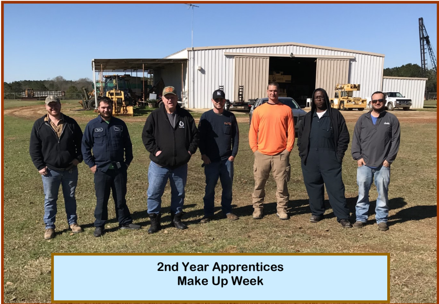
2nd Year Apprentices Make Up Week