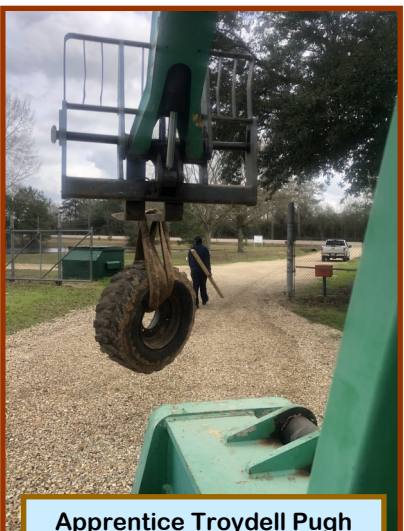
Apprentice Troydell Pugh working on tire for forklift