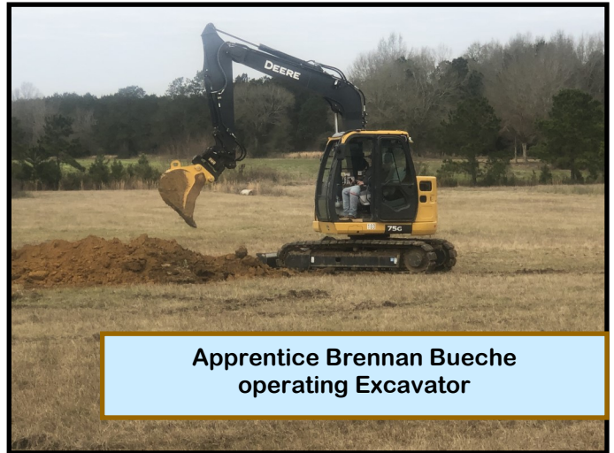
Apprentice Brennan Bueche operating Excavator