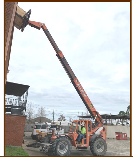
Brother Troy Allen with Boh Bros. operating forklift to install new air conditioning unit at Local 406's New Orleans office.

Remember to keep up with your certifications, be safe and God bless.