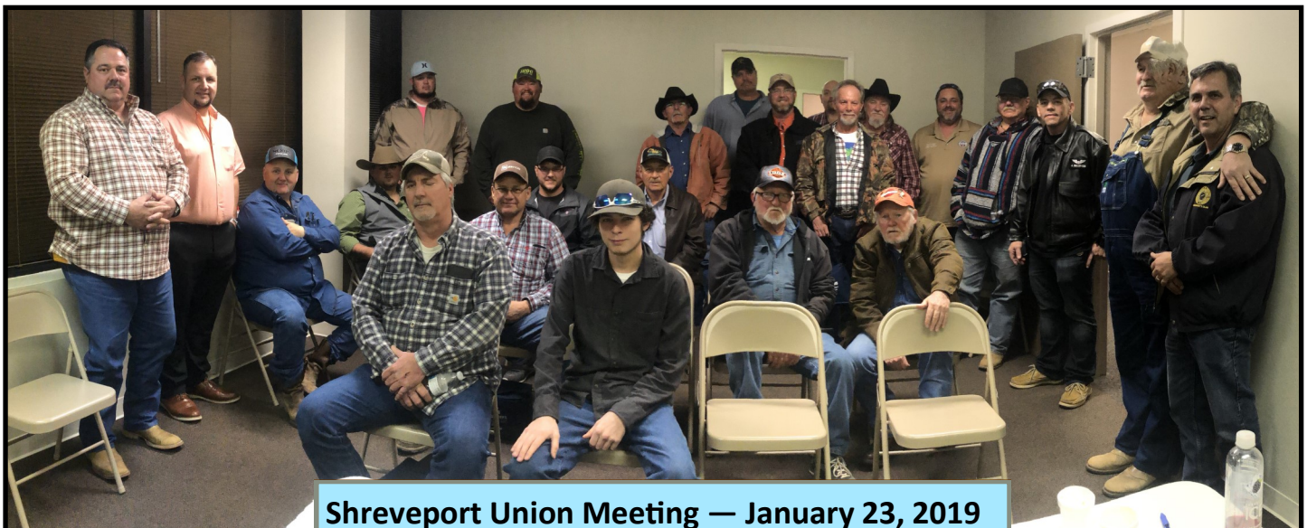
Shreveport Union Meeting — January 23, 2019

The Spring will be coming to a close soon and the children will be out for summer break. Please be mindful of this in your travels and if you are fortunate to get some time off during the summer, spend it with the ones you love making memories that will span a lifetime.