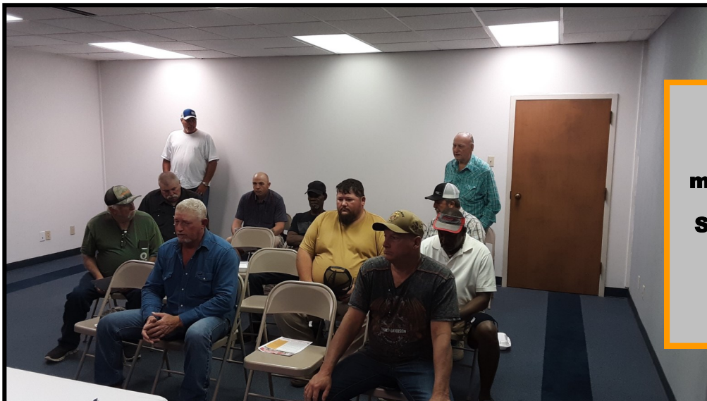
Brother members at the July Shreveport Union Meeting

However, to correct any discrepancies, the member involved must be able to furnish all check stubs for the fiscal year ( 10/1/20 - 09/30/21).