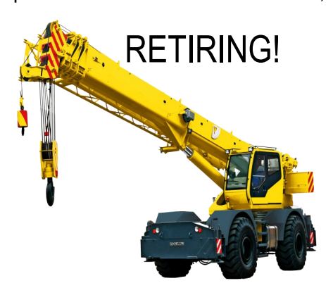
Goodbye TENSION Hello PENSION

I am a third generation Operating Engineer, following behind my Grandfather, Father and my Brother, all who were Officers of this organization. With starting as an Apprentice for Local 406 in 1982,