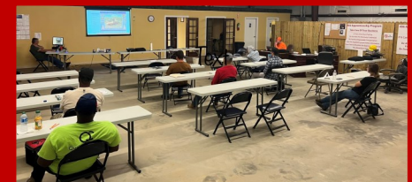
FIRST YEAR APPRENTICE CLASS PRE INSPECTION