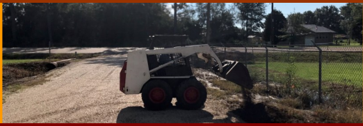
APPRENTICE TOMMY THOMPSON ON SKID STEER DRESSING UP THE SIDE OF THE ROAD