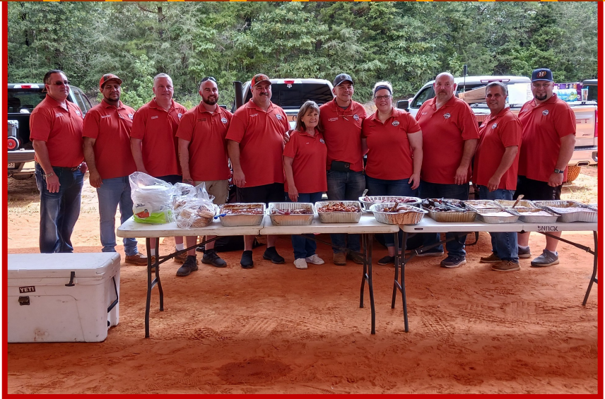
IUOE LOCAL 406 STAFF ENJOYING THE SHREVEPORT DISTRICT BBQ