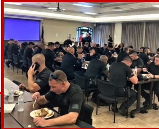
FEEDING THE MOBILE FIELD FORCE JOINT TRAINING WITH THE FEDERAL BUREAU OF PRISONS SPECIAL REACTION TEAM (HURRICANE PREPAREDNESS)