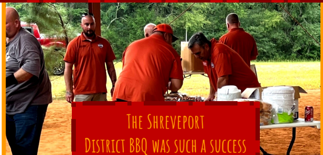
THE SHREVEPORT DISTRICT BBQ WAS SUCH A SUCCESS WITH LOADS OF FOOD AND FUN.