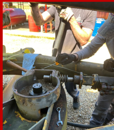
ROAD GRADER GEAR REMOVED